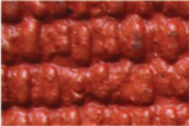
Embossed top coats

It's molded top layer together with geometrically designed and vulcanized bottom layer performs for maximum energy absorption and return, thus substantially reduces sports injury. The superior foot traction and consistent response of the track gives fast surface which have been proved by the IAAF to be the most desirable track systems of competition.